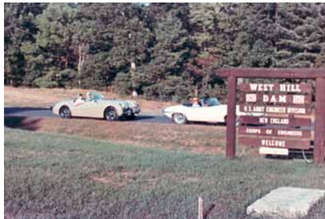
First NEXKA Gathering.