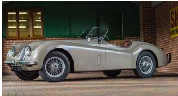
The XK120 at J. D Classics in England.