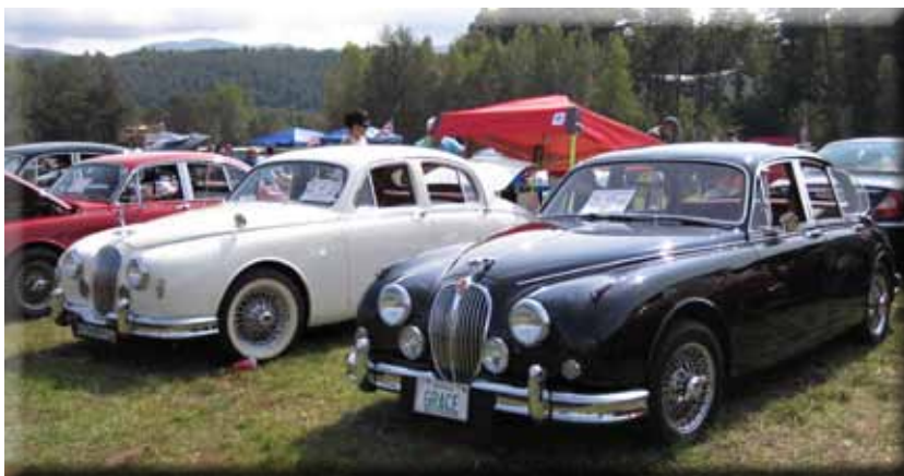
The Mark 1 (left) was the first small saloon, followed in 1960 by the Mark 2 (right)