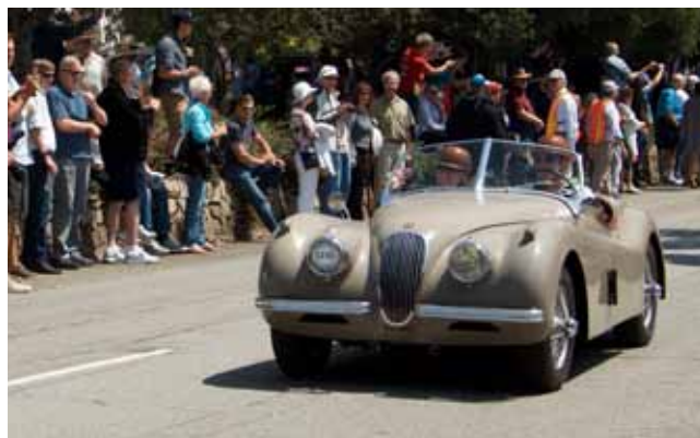
"Old Girl" on the Tour d'Elegance

A few problems faced them, however. Many of the improvements to make the "The Old Girl" survive the Mille Miglia rendered it questionable in a Preservation Class. Consequently, these modifications had to be reversed. Graham Engineering & Motorsport of Clifton, New Jersey, was tasked with the replacement of the vintage parts, many of which had been retained in storage.